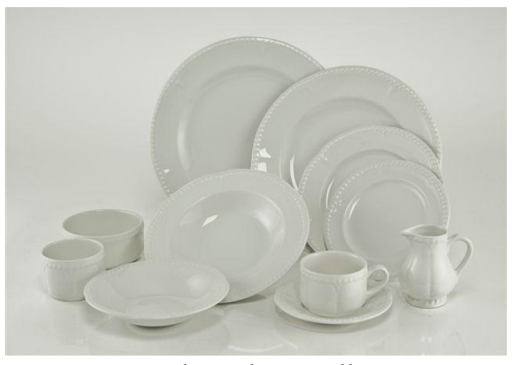
3 - Royal Doulton Collection