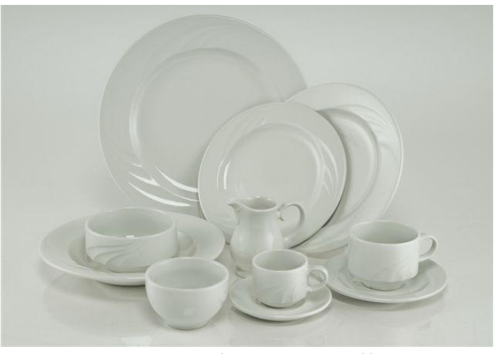
2 - Continental Everest Collection