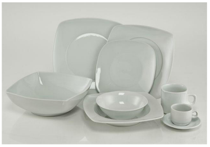
6 - Monarch Contemporary Collection