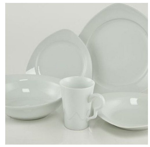
5 - Trillium Post-Modern Collection