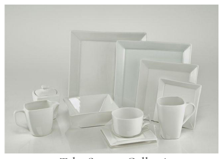
4 - Taka Square Collection