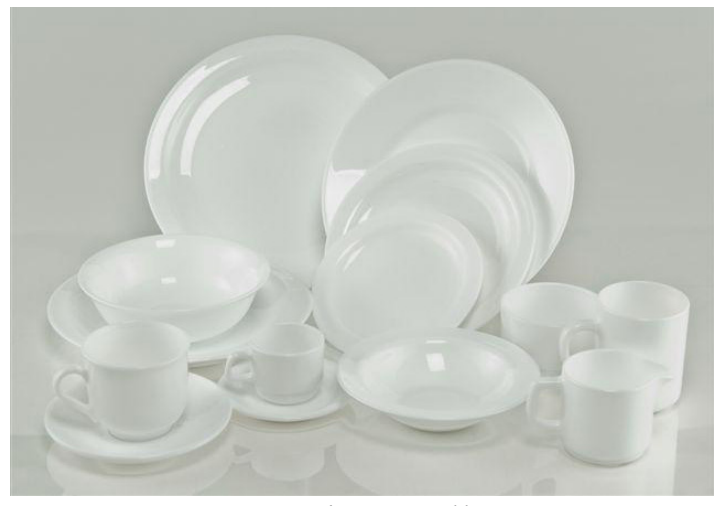
1 - Pure White Collection